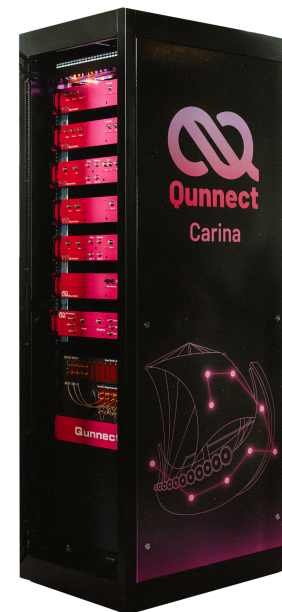
Qunnect Carina hardware

Central New Mexico Community College and UNM nodes will host dedicated Qunnect Carina teaching racks – allowing students at all levels to train on the same hardware used in operational quantum networks. This creates a talent pipeline from CNM’s two-year programs through UNM graduate research directly into industry and national laboratory careers.