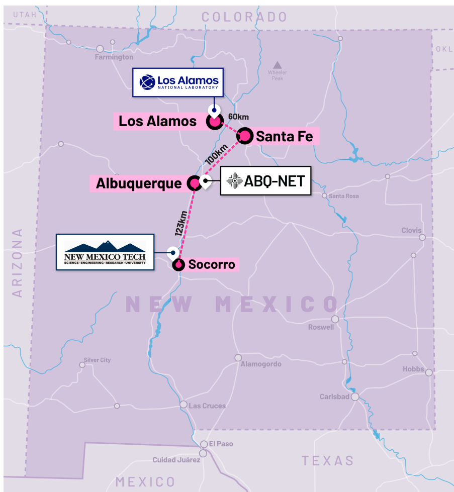
Proposed Phase 2 statewide expansion

The Phase 2 expansion would connect Los Alamos National Laboratory (LANL) via Santa Fe, creating a quantum corridor between the state’s premier federal research institutions. The Santa Fe & LANL segment (~60km) is achievable with Qunnect’s currently deployed hardware, validated in a recent demonstration with Deutsche Telekom at over 100km. Intermediate nodes along the Albuquerque & Santa Fe corridor would also serve as quantum repeater research sites – among the most sought-after experimental platforms in the field. Expanding south to Socorro extends the network to key research institutions (NMT, NSF, White Sands Missile Range, etc.) and provides expanded research opportunities.